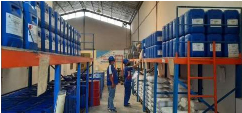
Figure 1. Chemical Management Site at PT Alkan Chemical Indonesia

From the results of the existing documentation, it can be concluded that PT Alkan Chemical Indonesia has achieved a clean environment, appropriate placement of occupational safety and health signs so that work accidents do not occur, has good lighting and good air circulation too, because every corner is PT Alkan Chemical Indonesia already has very bright lighting so it can operate safely, with lots of air ventilation and hexos fans so that air produced from chemicals does not settle in the room because it can be dangerous for employees.